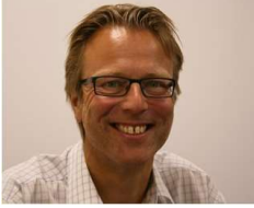
Chair Resigned 31 March 2021