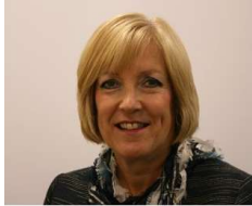
Commissioning Resigned 31 May 2021